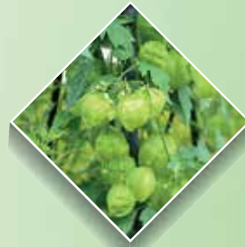
BALLOON VINE SPINACH