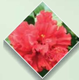
RED DOUBLE HIBISCUS