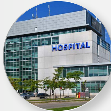
20 MINUTES HOSPITALS, BANK & SHOP