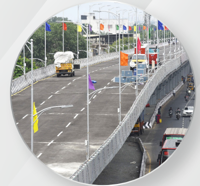
10 MINUTES GST & ORAGADAM