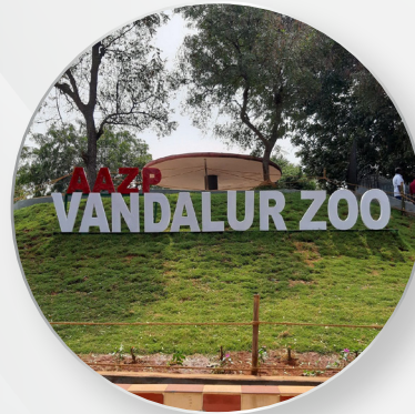
25 MINUTES VANDALUR & TAMBARAM