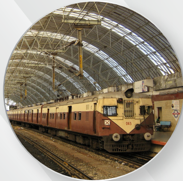
10 MINUTES SP KOVIL RAILWAY STATION