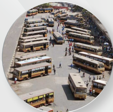
10 MINUTES BUS STAND