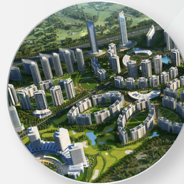
20 MINUTES SEZS