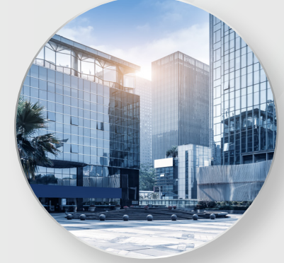
15 MINUTES MAHINDRA WORLD CITY