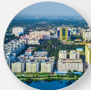
15 MINUTES SRM UNIVERSITY, COLLEGE & SCHOOL